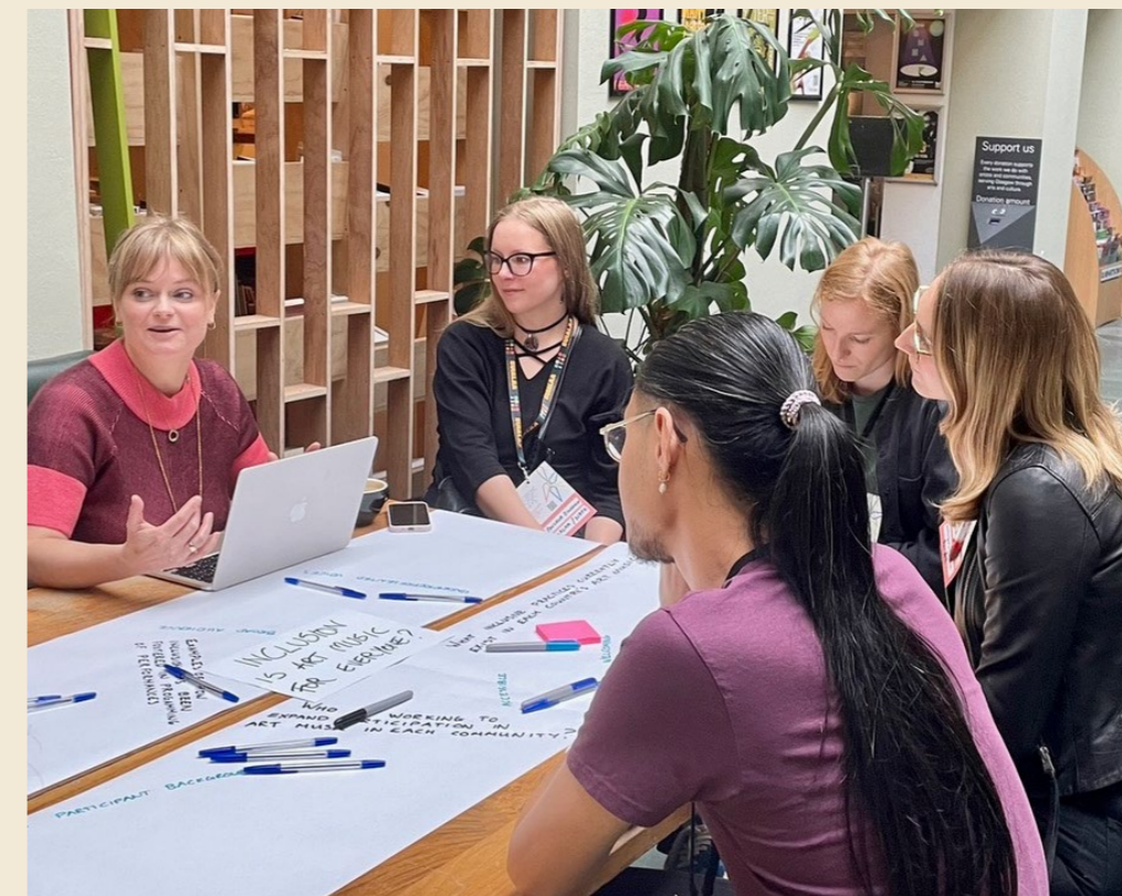
Nordic Music Days 2024