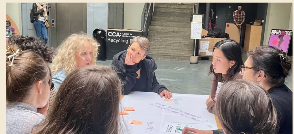
Nordic Music Days 2024 | Photo: STATUS

In October 2024, STATUS organized an open meeting during the Nordic Music Days festival in Glasgow. This session, titled Imagining Sustainable International Music Exchange, brought together artists and professionals from Norway, Finland, Iceland, Denmark, and Scotland. Discussions centered on culture in a world of crisis, inclusion and diversity, environmental sustainability, and the value of art music.