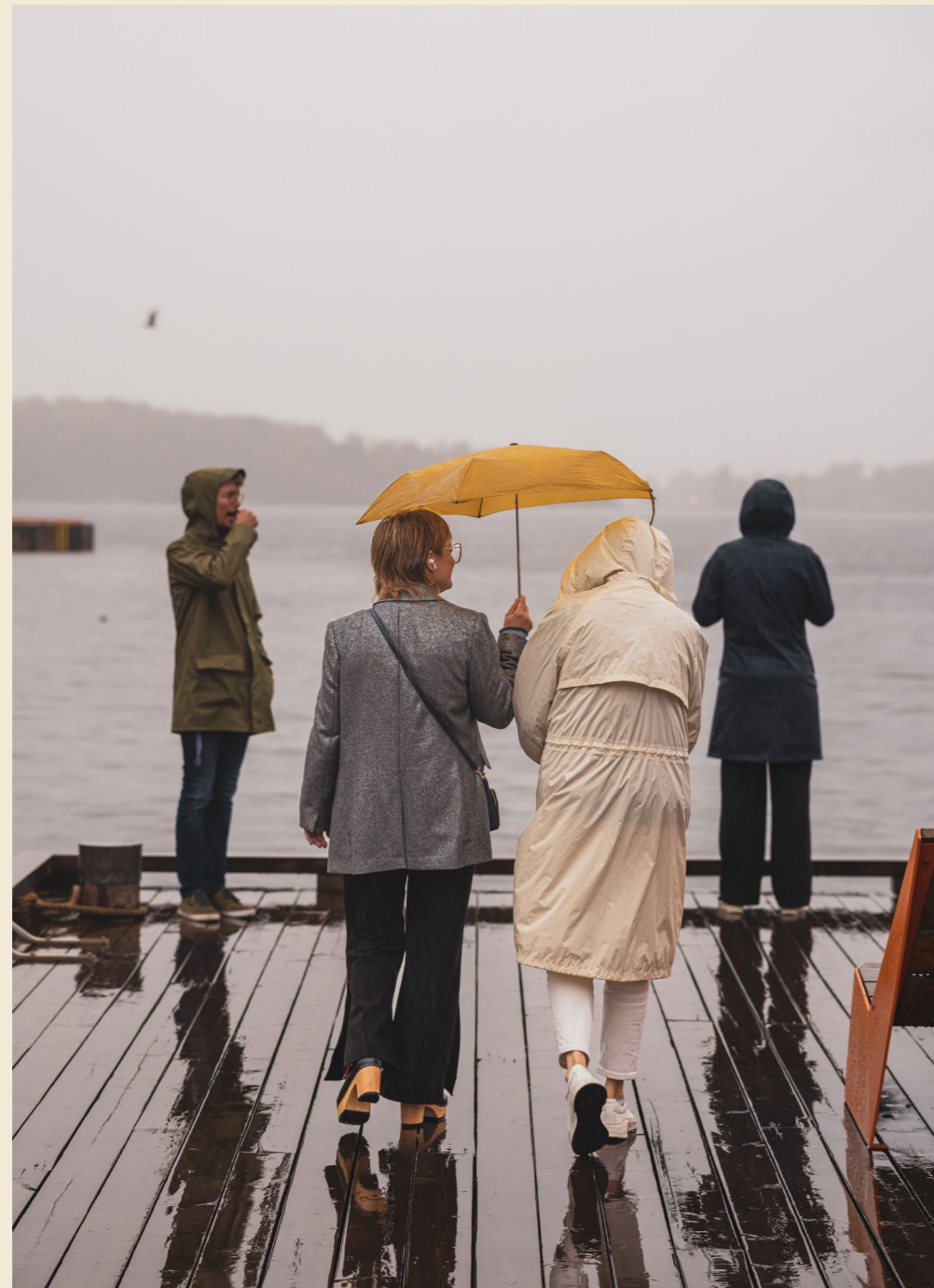
Lydvandring Ultima 2023

Through its open meetings, STATUS brings together individuals committed to promoting change within the contemporary art music field. These meetings provide a platform for exchanging ideas and strategies, reflecting the diverse views and experiences of the professionals within the network, rather than presenting a unified perspective on any issue. By fostering cross-border dialogue, STATUS continues to build momentum towards a more inclusive, sustainable, and interconnected music scene.