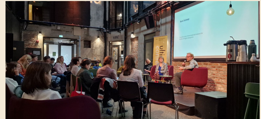
Ultima Festival 2023

In September 2023, during Oslo's renowned Ultima Festival, STATUS collaborated with Northern Connection to host an open meeting. This gathering convened music professionals and cultural organizers to deliberate on sustainable practices in the art music scene. Key topics included strategies for reducing the environmental impact of touring, enhancing the longevity of artistic careers, and fostering deeper Nordic collaborations.