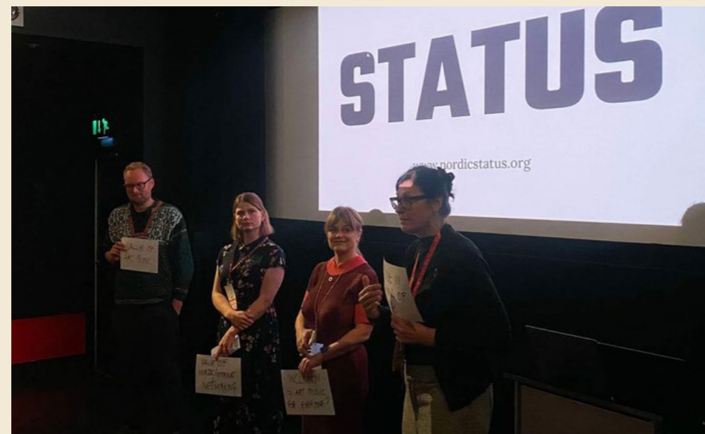
Nordic Music Days 2024

Please feel free to contact one of the partner organisations or write the STATUS Network. Email: admin@nordicstatus.org More information: nordicstatus.org