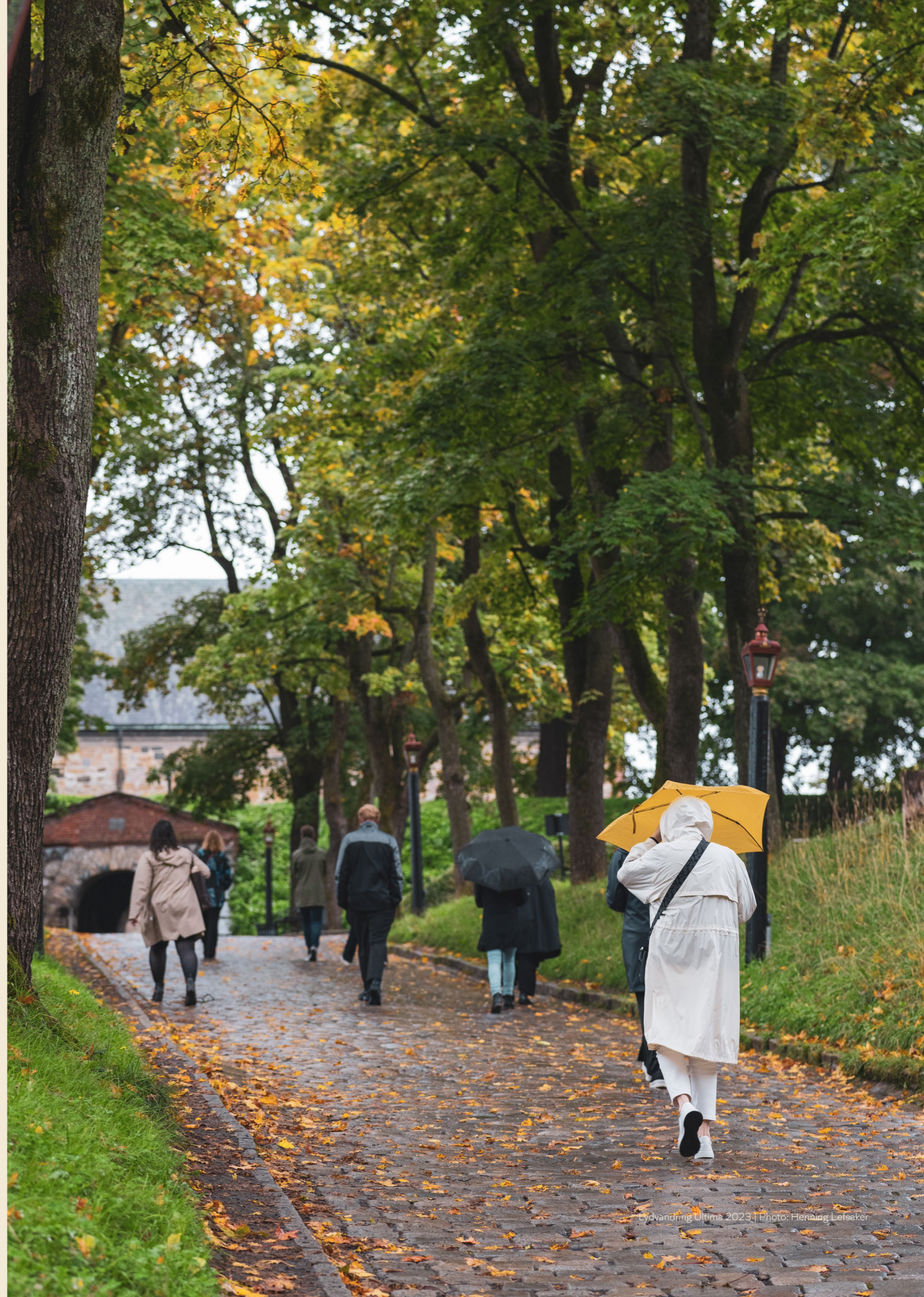
Lydvandring Ultima 2023