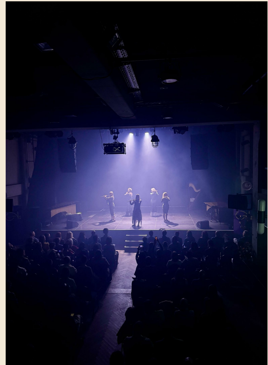
Classical:NEXT 2025 | Photo: STATUS

At Classical:NEXT, STATUS plays a key role in organizing the Nordic shared stands, creating a platform for showcasing Nordic contemporary music and fostering connections with international music professionals. In addition to the shared stand, STATUS collaborates with the Nordic embassies to organize a reception at the event. While the embassies take the lead in organizing the reception, STATUS contributes to its execution. The reception provides an informal and welcoming space for networking, offering participants a chance to engage with one another and strengthen the Nordic presence at Classical:NEXT.