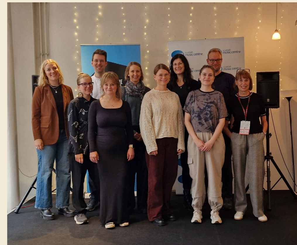
The STATUS Network , Nordic Music Days 2024