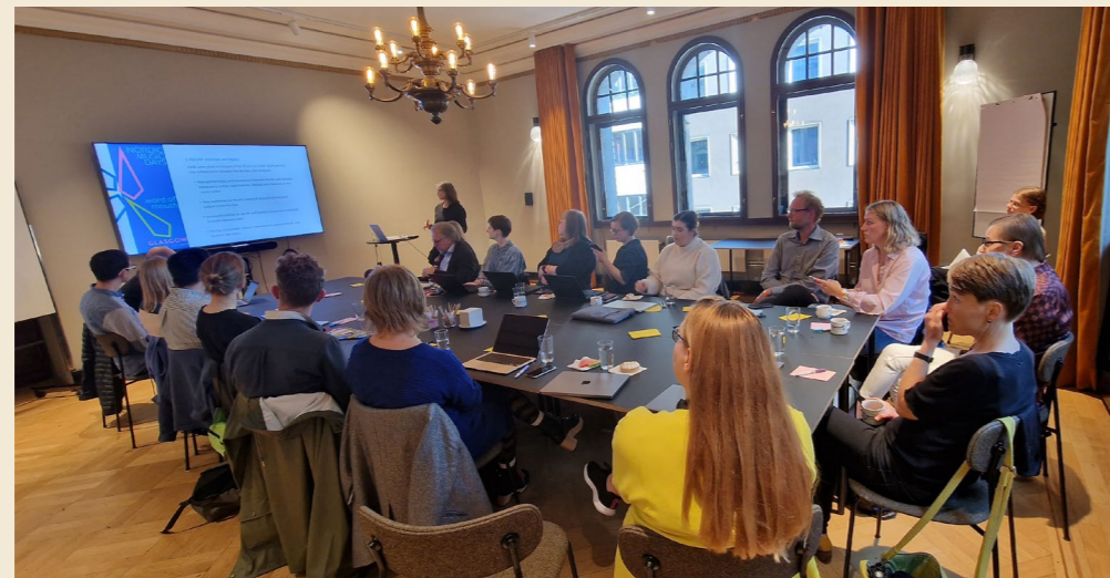
Ultima Festival 2023

At Nordic Music Days, STATUS partners collaborated on a delegates program that facilitated exchanges within the Nordic contemporary music scene. The program connected professionals from various countries, promoting networking and new collaborations. Through this initiative, STATUS strengthened international ties and helped highlight Nordic contemporary music on a larger scale.